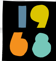
THE 1968 EXHIBIT

In conjunction with The 1968 Exhibit , this series offers avenues of activism in the St. Louis area. Topics such as community engagement and active citizenship are examined from different perspectives.